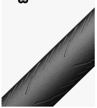
PRO COMPOUND Our most resistant and durable roadspecific formulation, for the cyclists looking for a smooth ride.