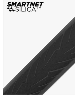
SMARTNET SILICA Patented road-specific formulation, developed to obtain better grip and durability in every weather condition