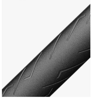
EVO COMPOUND Performance and durability on the road, reliable in every kind of weather condition. For P ZERO™ only.