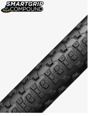
SMARTGRIP COMPOUND Our most advanced off-road compound, developed with World Cup riders and the Pirelli engineers in charge of motocross and rally tyres.