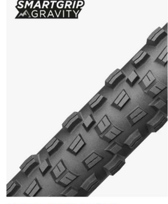
SMARTGRIP GRAVITY COMPOUND A special Enduro and gravity E-MTB compound developed with the help of former downhill world champions

The SmartGRIP+ Compound is a special chemical formulation specifically designed for e-bikes as it provides better tear resistance which is a crucial feature for modern electric mountain bikes