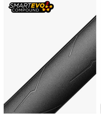
SMARTEVO<sup>2</sup> COMPOUND Our most advanced road-specific formulation ever. For P ZERO™ only.