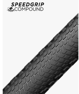
SPEED GRIP COMPOUND Gravel specific formulation derived from the rally, where speed on asphalt and grip on dirt are crucial.