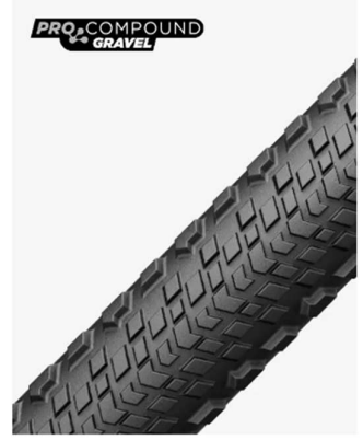
PRO COMPOUND GRAVEL Our most resistant and durable gravelspecific formulation, for the cyclists looking for explore new roads.