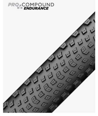
PRO COMPOUND ENDURANCE Our cap & base off-road compound designed for a relaxed, non-competitive approach to MTB