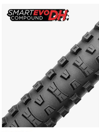
SMARTEVO DH The supersoft compound of the downhill PRO athletes, the most performing ever