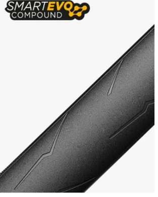
SMARTEVO COMPOUND Our most advanced road-specific formulation ever. For P ZERO<sup>™</sup> only.